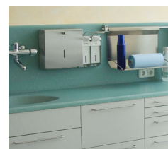
Outpatient & Consultation